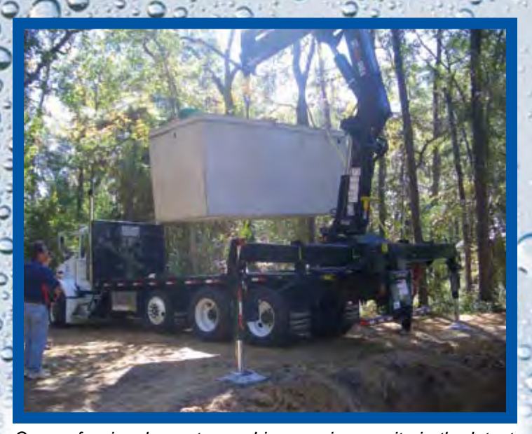
Our professional, courteous drivers arrive on-site in the latest, state-of-the-art trucks with monorail or knuckleboom cranes.